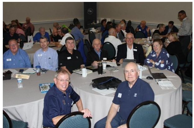
It isn't work if you are having fun!