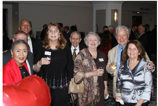
Camaraderie with a Purpose!