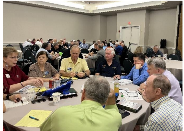
The President is listening!