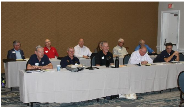
Council Board of Directors Meeting