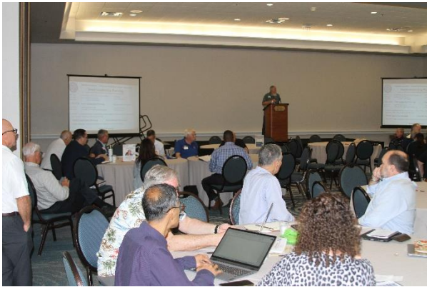
OK, time to get to work!