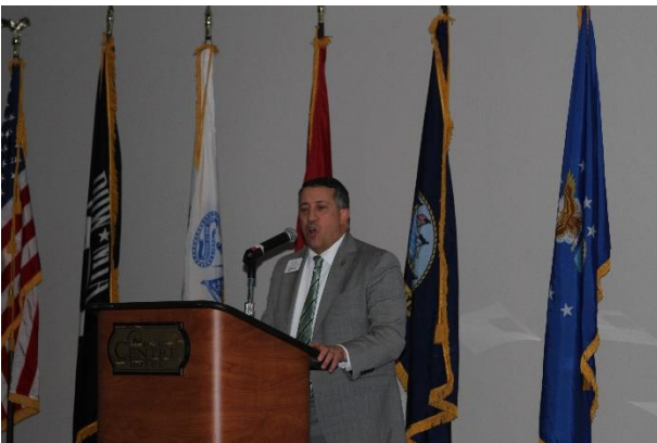
Words from the President & CEO